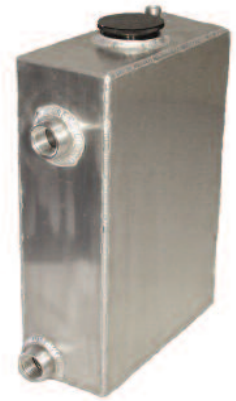
Oil Tank, Welded