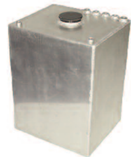
Fuel Tank, Welded